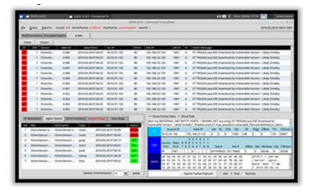
Fig. 2. Sguil interface

ELSA also provides a user interface that can be used for analysis of traffic and filtering of it by IP, port, service, connection duration and many others. It provides access to asset, session and transaction data and data can also be searched using Bro queries